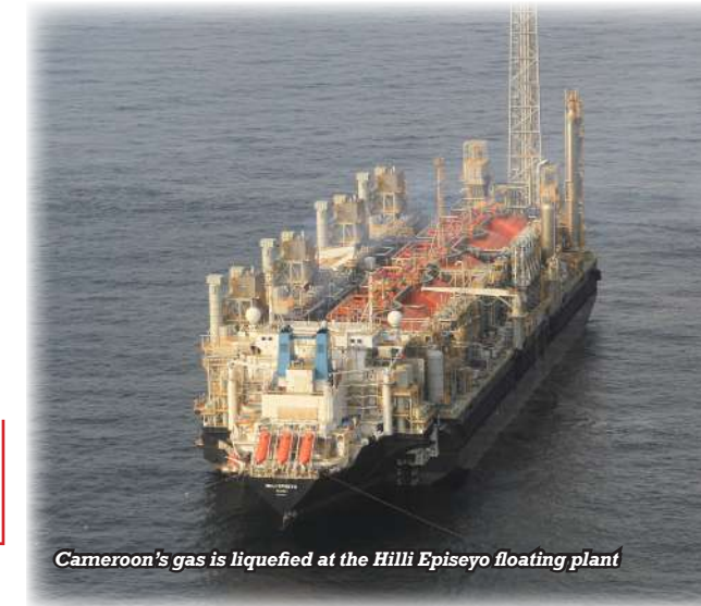
Cameroon's gas is liquefied at the Hilli Episeyo floating plant

LNG is obtained by condensing natural gas which, once cooled to -163^{\circ}\text{C} , becomes liquid. Liquefaction reduces the volume of the gas 600 times, making it possible to transport it by ship and thus export it. Once at its destination, the LNG is heated and returns to its gaseous state. LNG is different from LPG (domestic gas).