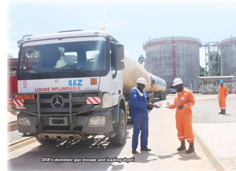
SNH's domestic gas storage and loading depot